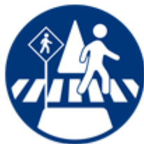
Medians and Pedestrian Crossing Islands in Urban and Suburban Areas