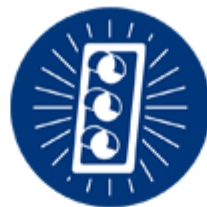
Backplates with Retroreflective Borders