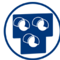
Pedestrian Hybrid Beacon