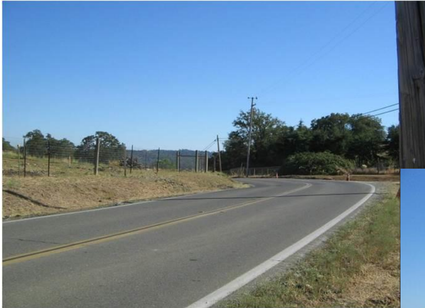
Before Safety Improvement