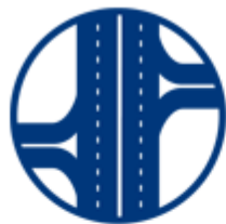
Corridor Access Management