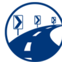
Enhanced Delineation and Friction for Horizontal Curves