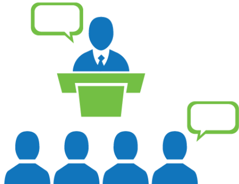
Town Hall Meetings