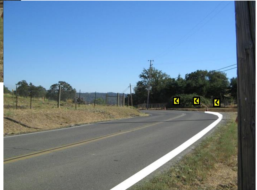
Proposed Low-Cost Improvement